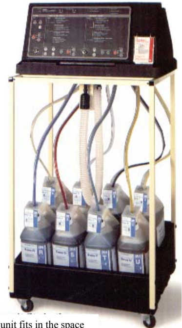
Entire unit fits in the space of a single 55-gallon drum